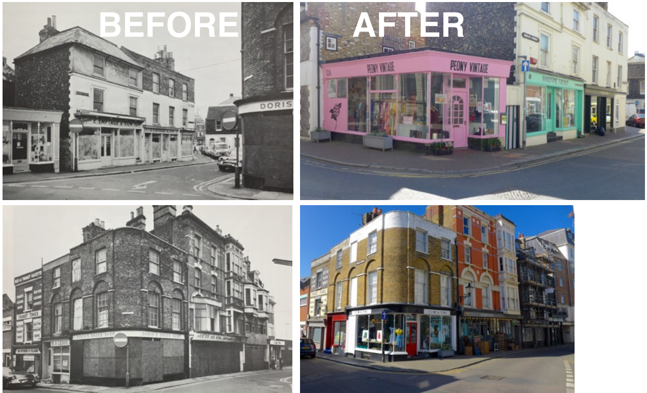
Margate before and after heritage led regeneration. To the left empty premises with shops boarded up. To the right buildings restored and thriving with new businesses

Many towns across the country have had help with heritage led regeneration. One example is our near neighbour Margate where English Heritage has provided guidance and £1.2m of funding (another £1.3m of funding also came from other sources) that has rejuvenated the town centre. Why shouldn't this happen in Southend-on-Sea where we have an historic street in Hamlet Court Road? The answer is that it can and that this has now started to happen. However, this work needs a growing and wider support which is where you can help.